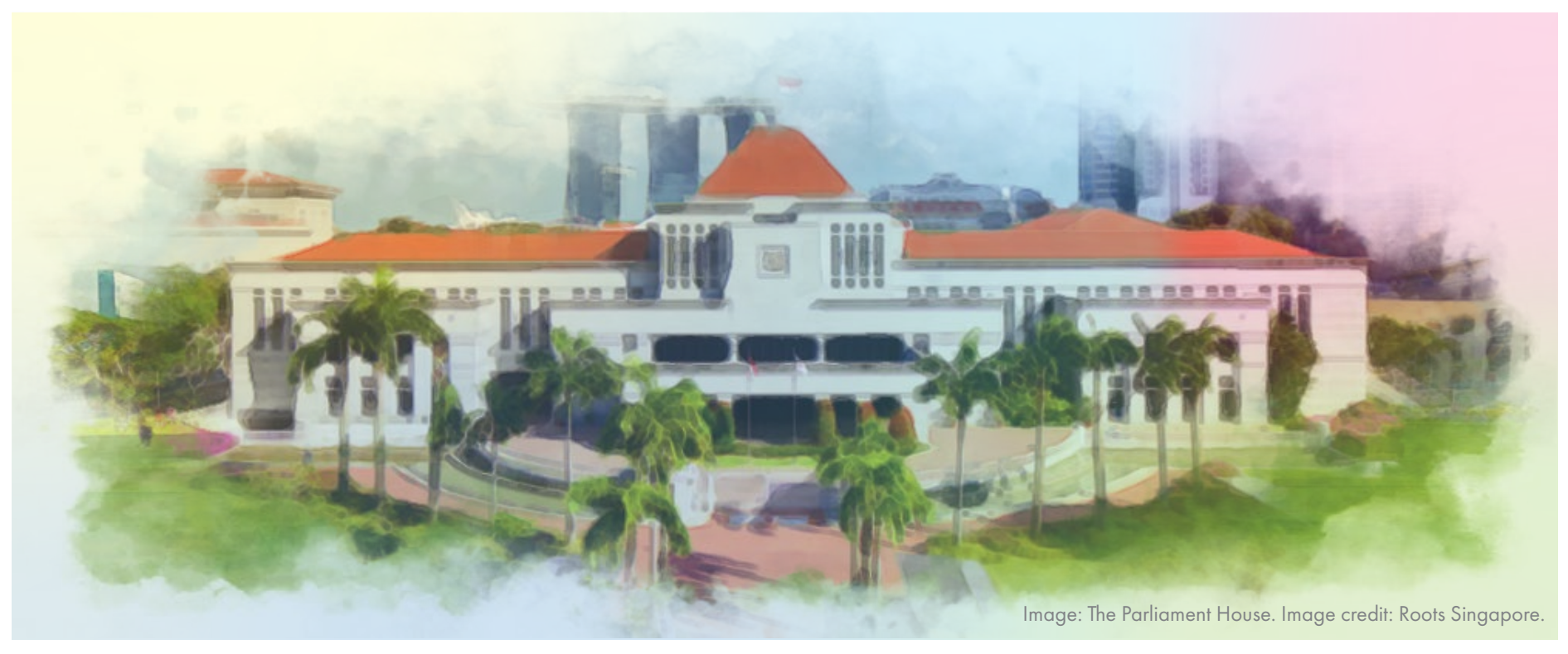
Singapore celebrates its 60th National Day.