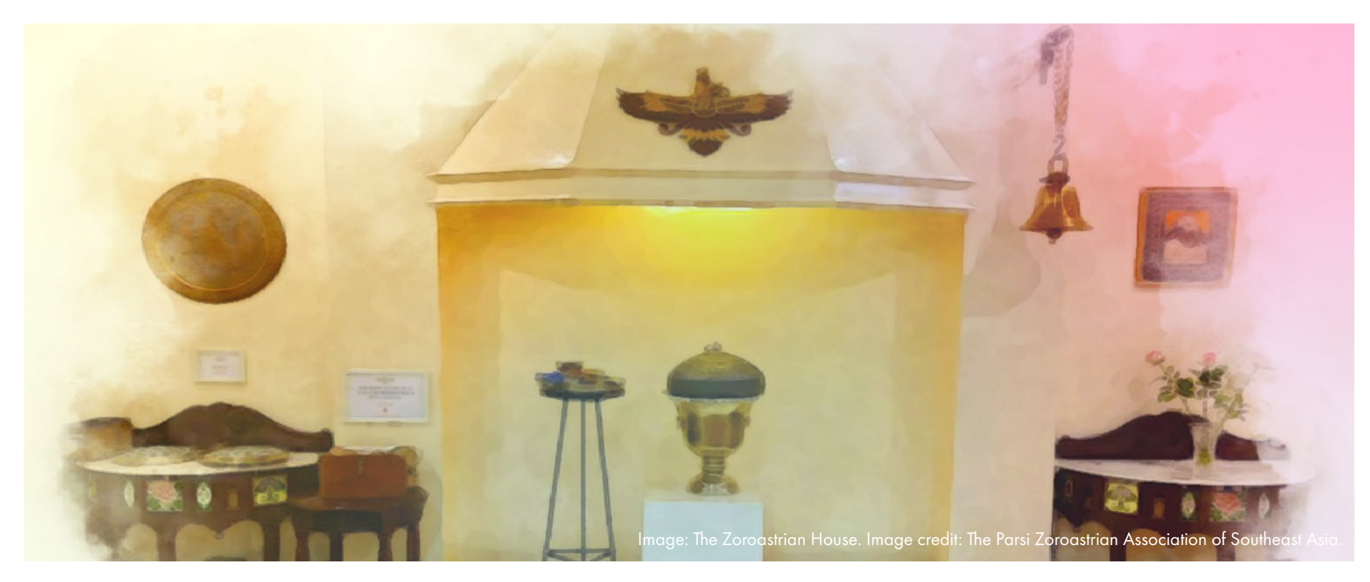
The Zoroastrian House (ZH) is a shophouse on Desker Road, procured in 2011 by Homiyar Vasania, a prominent member of the Singaporean Zoroastrian community. The sole prayer hall for Parsis in Singapore is located within. The House serves as home to the Parsi Zoroastrian Association of Southeast Asia.